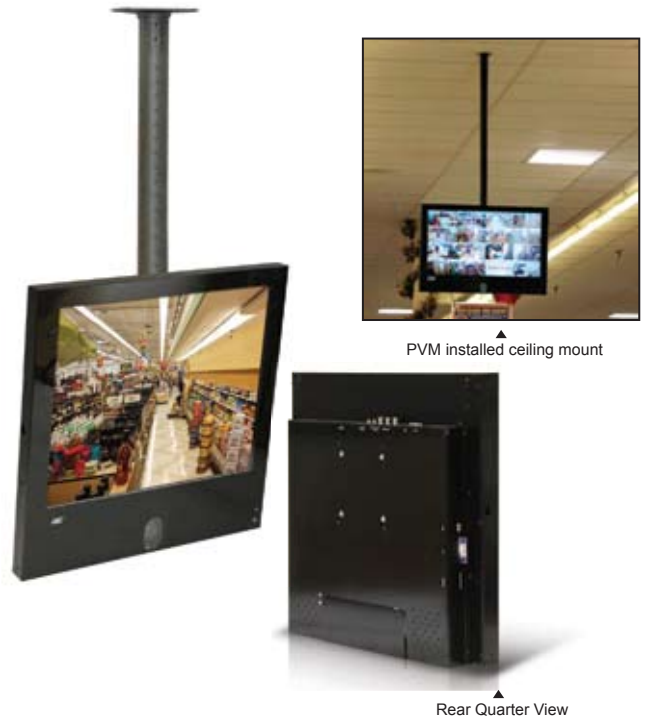
PVMV installed ceiling mount